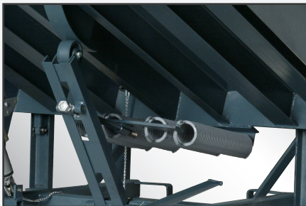
One point adjustable main spring assembly with roller and cam construction.